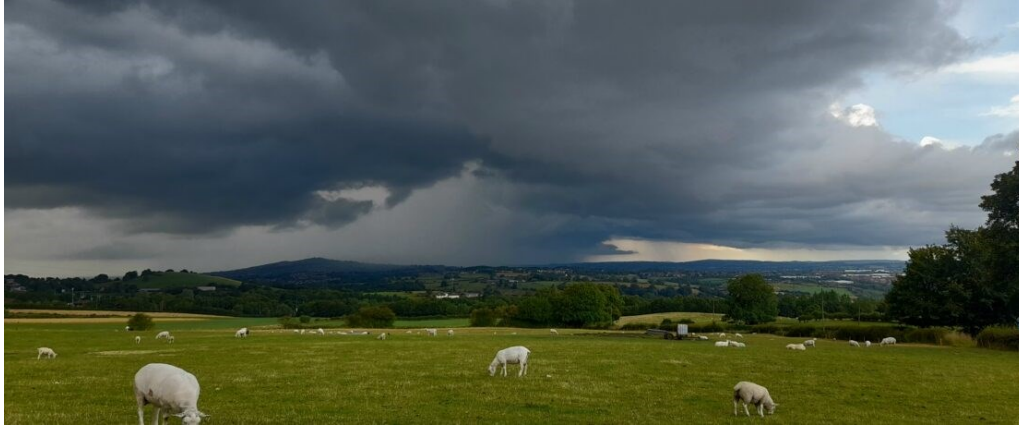
Site CT1: Bells Hollow looking towards Mow Cop - Ian and Mandy McMillan

proposed allocations. We also objected to the proposed alteration of the Green Belt boundary in Policy PSD5.