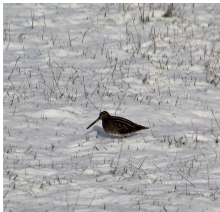
Site CT1, one of the sites proposed for development in the Local Plan.

Our response to the current consultation on the Local Plan (Regulation 18 consultation) reiterates our opposition to the large amount of proposed greenfield and Green Belt development sites, which appear to form over 70% of the number of houses included in the proposed allocations. We also objected to the proposed alteration of the Green Belt boundary in Policy PSD5. We are concerned at the encouragement of (undefined) 'balanced