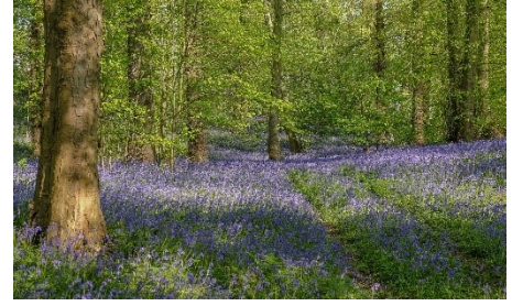
Bluebells at Aqualate, Tony Leech.

Calling all photographers! We're launching a FREE photography competition with a view to producing a 2024 calendar depicting Staffordshire's wonderful and diverse countryside.